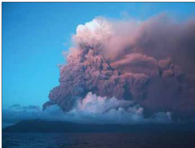
Figure 1. The eruption of Anatahan as observed at dawn on May 10, 2003, from a small ship installing PASSCAL seismographs in the Northern Mariana Islands.

Wiens, D.A., P.J. Shore, S.H. Pozgay, A.W. Sauter, and R.A. White, Tilt Recorded by a Portable Broadband Seismograph: The 2003 Eruption of Anatahan Volcano, Mariana Islands, Geophys. Res. Lett. , subm. 2005.